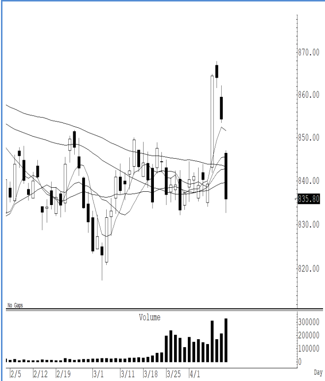
S50M24 (Close 835.80 Chg -18.50)